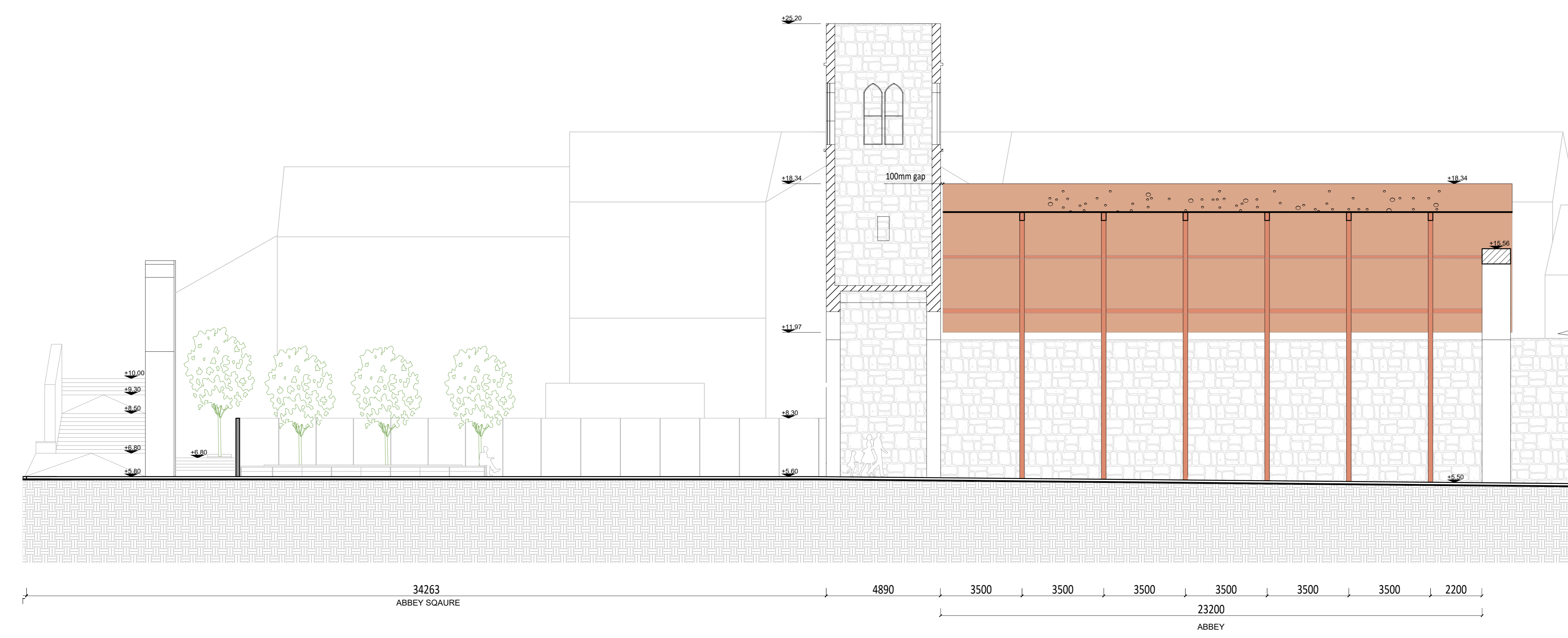
SECTION A'-A' (Fragment 2) 1:100